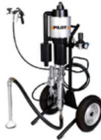
Pnumatic Airless Painting System