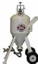
Soda Blasting System