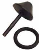
Pop Up Valve