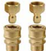
High Pressure Connector