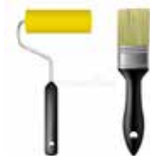
Paint Brush And Paint Holder