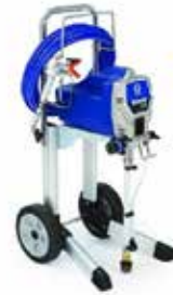
Electrical Airless Painting System