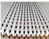
Paint Booth Filter