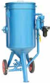
200ltr Blasting machine