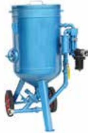
100ltr Blasting machine