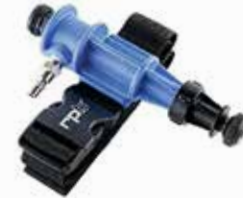
Cool Air Tube