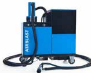
Dust Free Blasting Machine