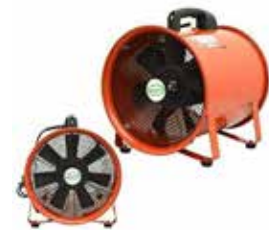
Portable Ventilator Fans