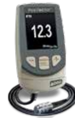
Positector Coating Thickness Standards