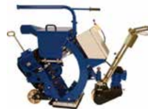
Floor Blasting Machine