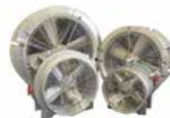
Pneumatic Air Blower