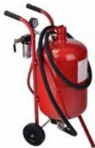
Mini Blasting Machine