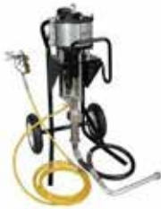
Air Assisted Airless Spray Pump