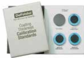
Coating Thickness Standards