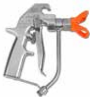
Airless Painting Gun