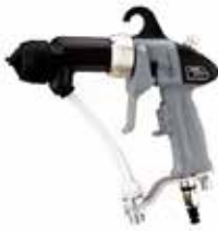
Electro Static Painting Gun