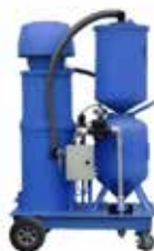
Vacuum Recovery System