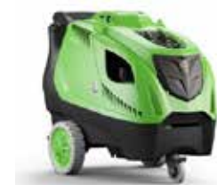
High Pressure Washer